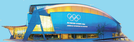
Richmond Olympic Oval