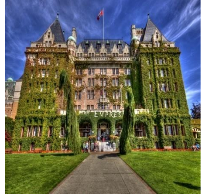
Fairmont Empress Hotel